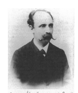
Cumlle queri 1889 C. Golgi